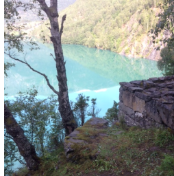
The W house site 2017.