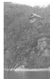
The W house.